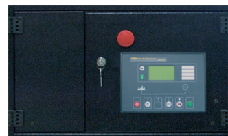
Deep Sea 7510 Loadshare Control Panel